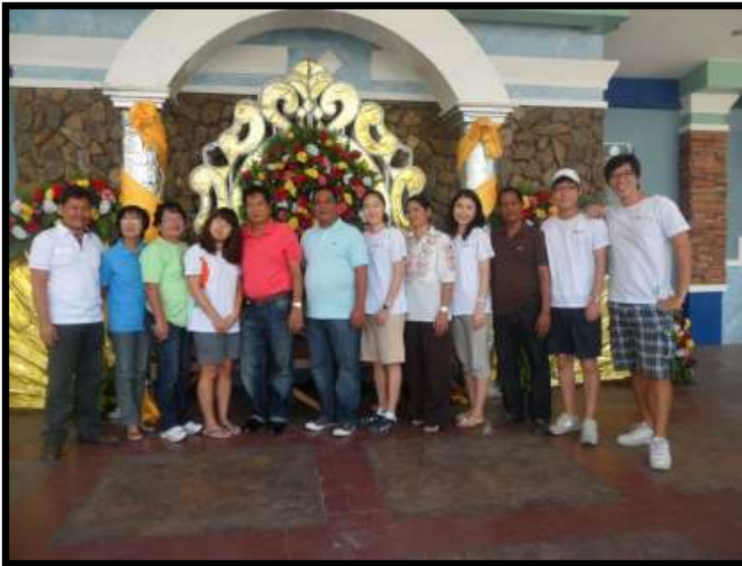
With Mayor and Councils