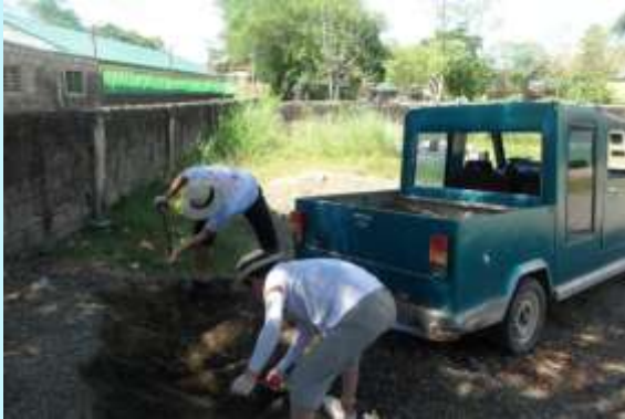
-Arranging play ground